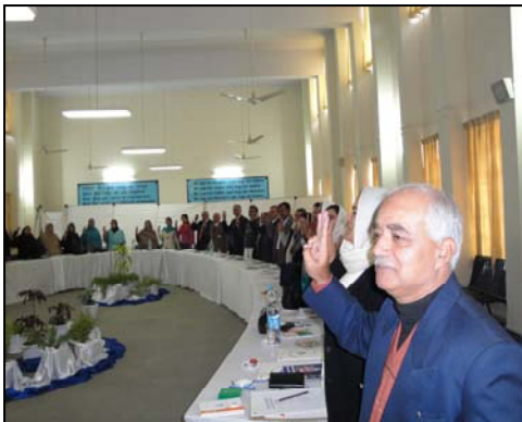
Head of Education Institutions POF Wah Cantt, Rawalpindi during Introductory Seminar on 25 January 2010.

To keep in pace and work in harmony with other NSOs of the World with speed, efficiency and promptness and meet the new challenges, the National Headquarters PBSA is emphasizing on internet and working to develop a comprehensive National Scout Data Base Management / Registration System and Network to respond to the needs of new era and growth of Scouting. It was encouraging to note that some of the Provincial Headquarters have installed the internet to keep themselves apprised of various National and International events. Those Provincial Headquarters who have not been able to do that, so far, should also immediately develop the internet facility and circulate their e-mail address to all other Provincial Associations and worthy members of their respective National and Provincial Councils. The National Headquarters will be circulating the highlights of various activities, programmes, upcoming events and newsletters on its website / e-mail to keep its members / Scouts updated / well informed.