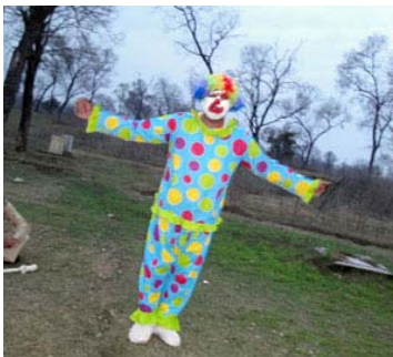
Rover Scout performing Camp Fire item during Selection Camp of the Best Scout for the year 2009