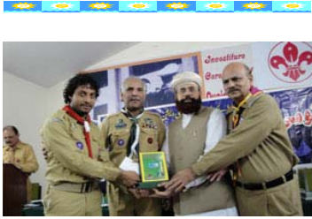
● 22 nd Seerat un Nabi Speech Contest for Rover Scouts on 25 Feb 2010 at NHQ PBSA