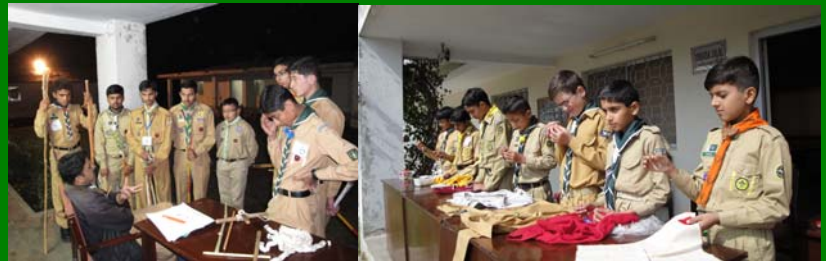
Activities / Assessment during Selection Camp for the Best Shaheen and Boy Scout for the Year 2009