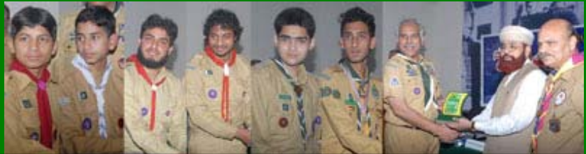
Federal Minister for Religious Affairs, Syed Hamid Saeed Kazmi, giving away Awards / Prizes to the Boy and Rover Scouts on occasion of speech contest in connection with Seerat un Nabi at NHQ, PBSA, Islamabad on 26 February 2010