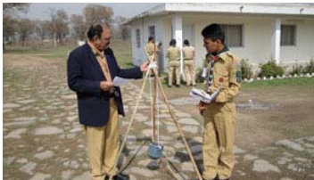
● Selection Camp for the Best Scout for the year 2009 held at NHQ PBSA from 26 to 28 Feb – 2010