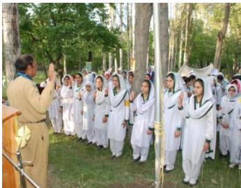
● Scouting for the Safe Future of FATA Youth