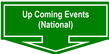
● Ramzan Activities on 14 August 2011.