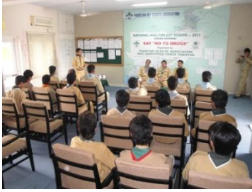
● Scouting in Skardu, Gilgit-Baltistan