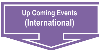
● Asia Pacific Regional Scout Jamboree on the Internet – August 2011.