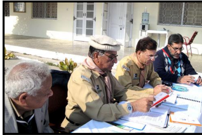
National Training & Program Sub-Committee Meeting