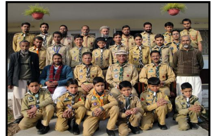
Best Scout Selection