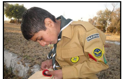
Best Scout of the Year Selection Camp - 2011