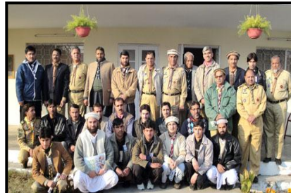
Visit of Swats Scouts