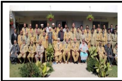
National Council Meeting - 2011