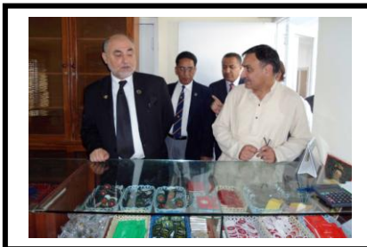
Chief Commissioner visiting Scout Shop