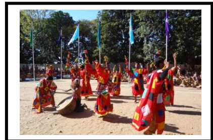
Folk Dance of Sindh during Punjab Camporee