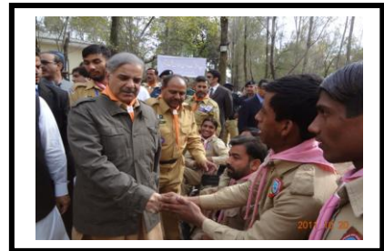
Welcome of Chief Minister Punjab during Punjab Camporee