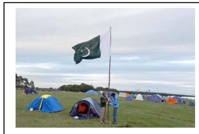
22 nd World Scout Jamboree-Sweden