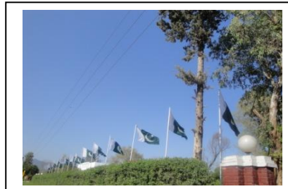
Celebration of Independence Day-NHQ