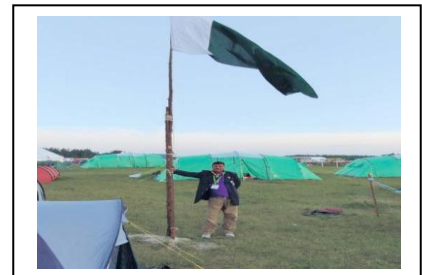
22 nd World Scout Jamboree-Sweden