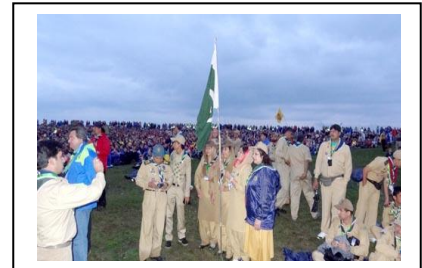
22 nd World Scout Jamboree-Sweden